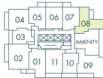
SOUTH TOWER LEVEL 4