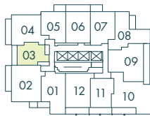
SOUTH TOWER LEVEL 5-26