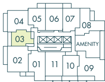
SOUTH TOWER LEVEL 4