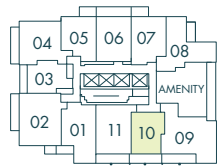
SOUTH TOWER LEVEL 4